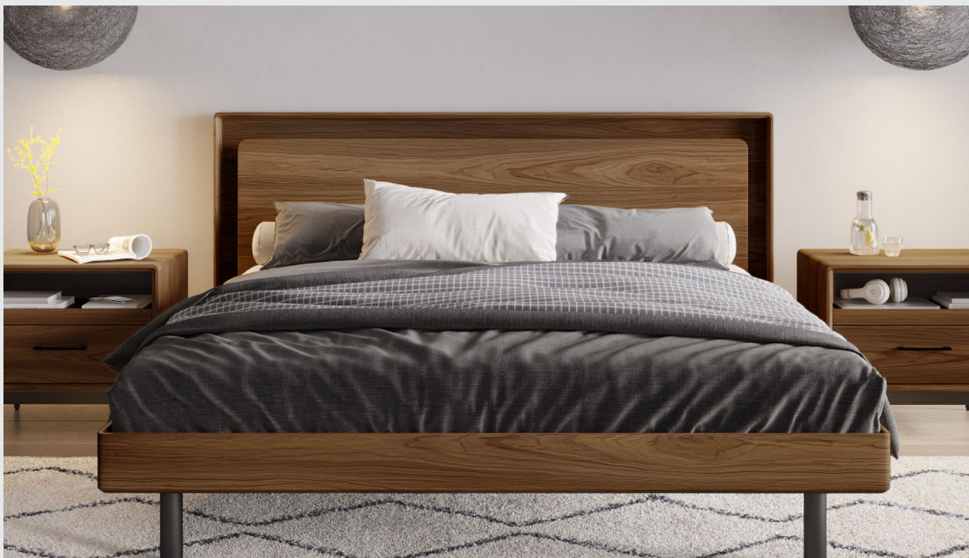
Up-LINQ 9119 King Bed with 28" Nightstands