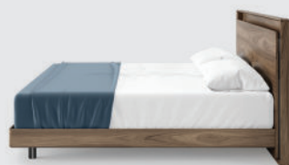
Platform Position: High Frame Position: Low Platform Height: 11 in | 28 cm (12" Mattress shown)