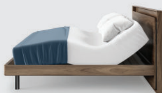
Platform Position: Low Frame Position: High Platform Height: 11 in | 28 cm (12" Adjustable Mattress shown)