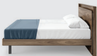
Platform Position: High Frame Position: High Platform Height: 14 in | 36 cm (10" Mattress shown)