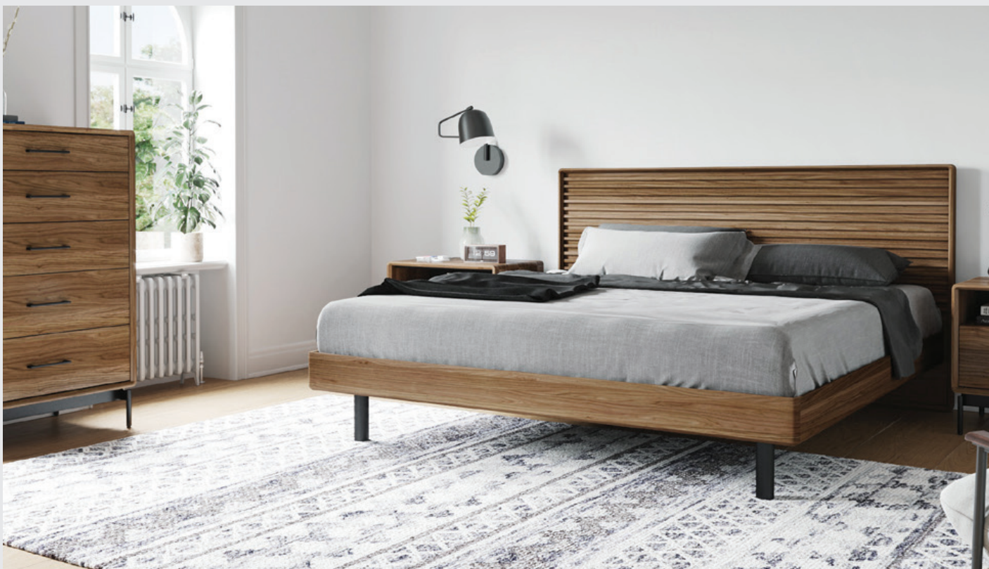
Cross-LINQ 9129 King Bed with LINQ Chest and 22" Nightstands