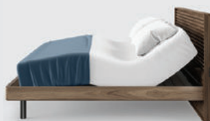
Platform Position: Low Frame Position: High Platform Height: 11 in | 28 cm (12" Adjustable Mattress shown)