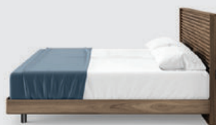
Platform Position: High Frame Position: Low Platform Height: 11 in | 28 cm (12" Mattress shown)