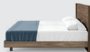
Platform Position: Low Frame Position: Low Platform Height: 8 in | 21 cm (14" Mattress shown)