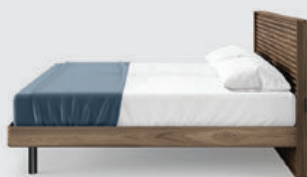
Platform Position: High Frame Position: High Platform Height: 14 in | 36 cm (10" Mattress shown)